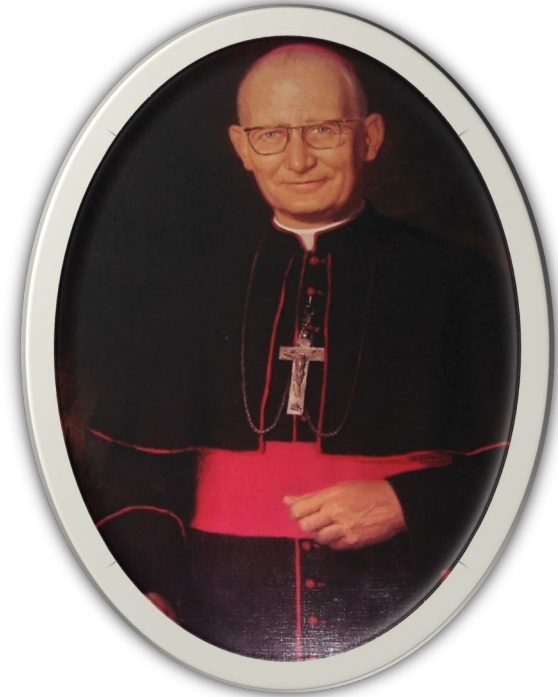
Cardinal James Knox Archbishop of Melbourne 1967-74