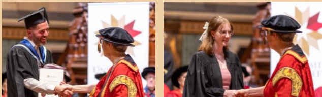
University of Divinity graduation ceremony 20 March 2026

We would love to get in touch with you! Join the Alumni network and gain access to Alumni Atlas .